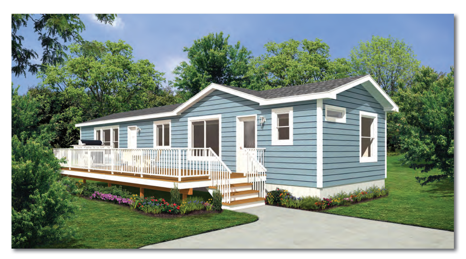
ST. MICHEL Model 16202