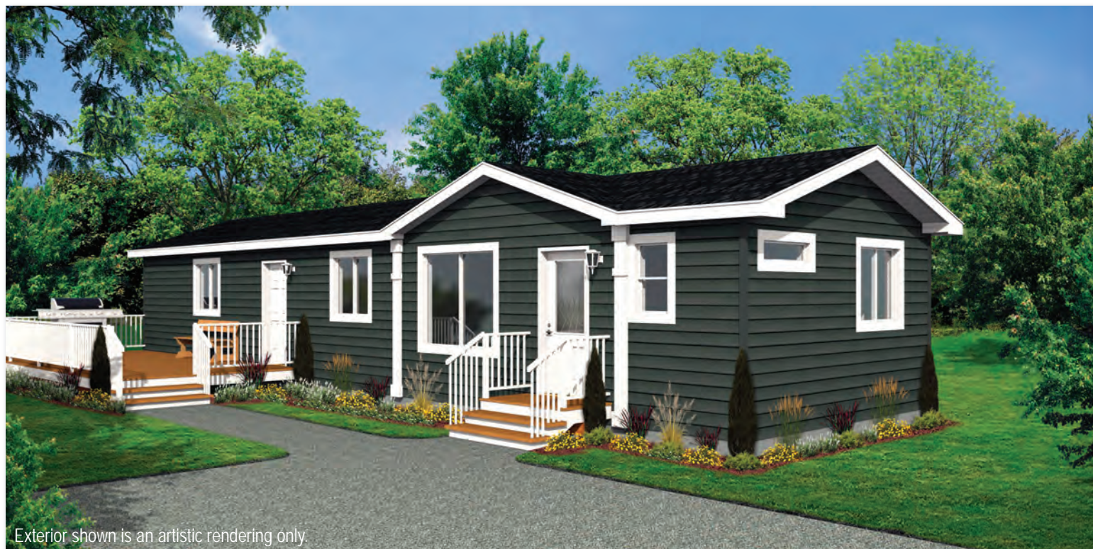
Exterior shown is an artistic rendering only.