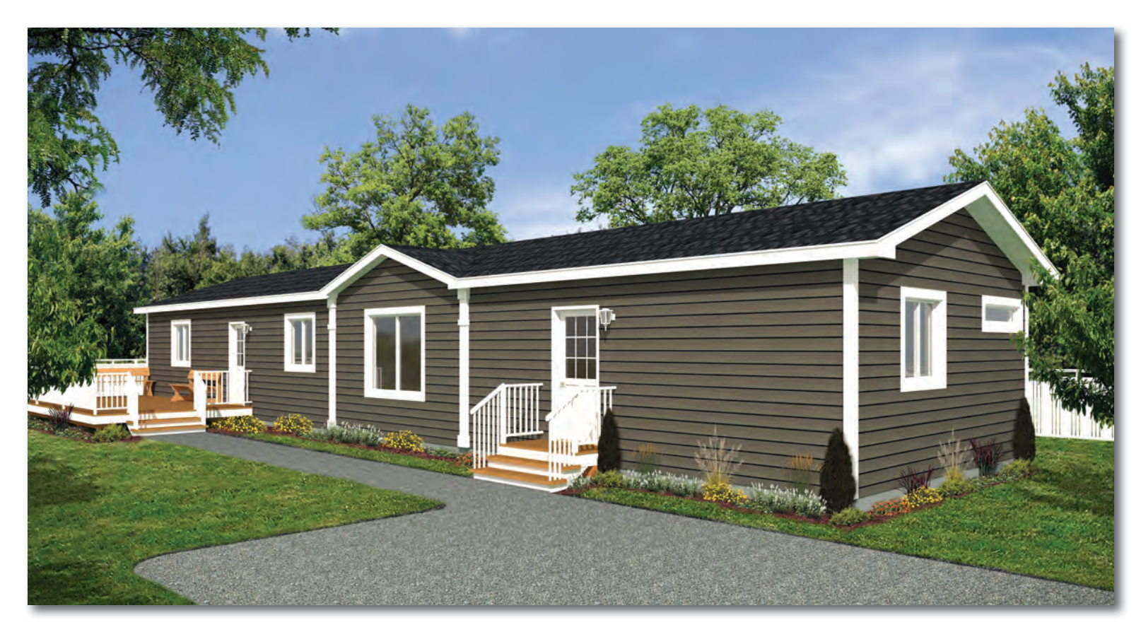
ST. PAUL Model 20201