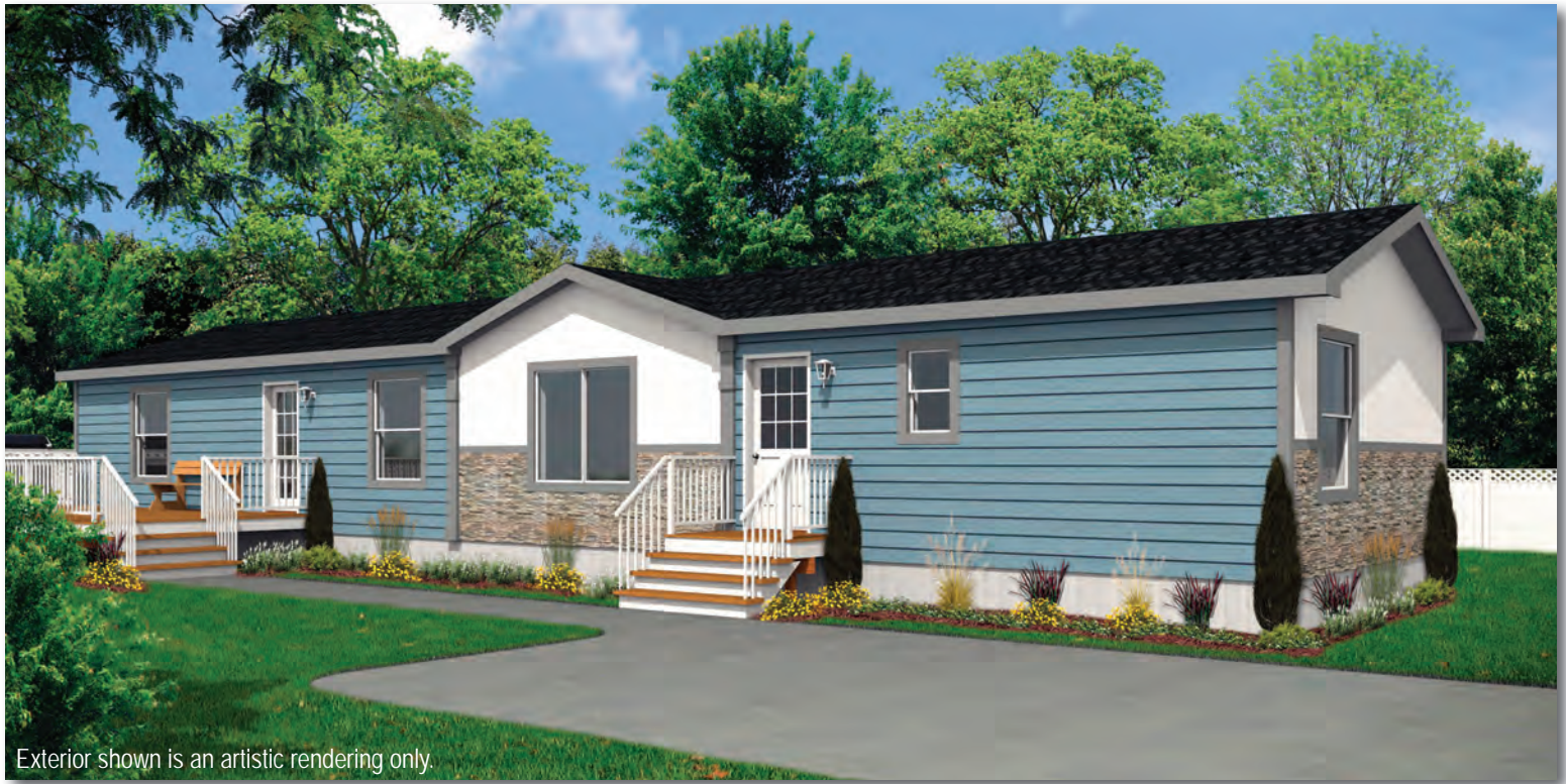
Exterior shown is an artistic rendering only.