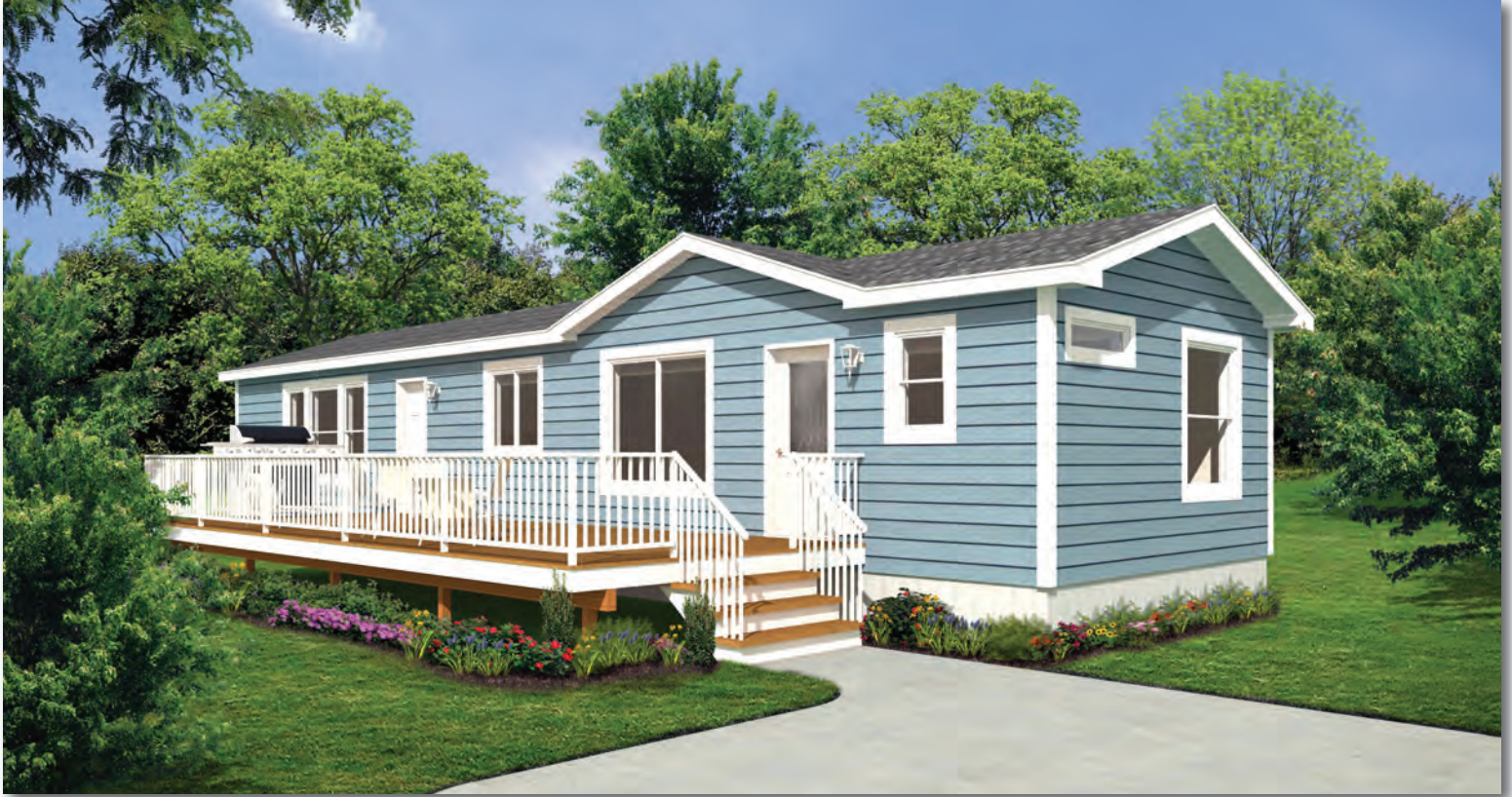
St. MICHEL Model 1620