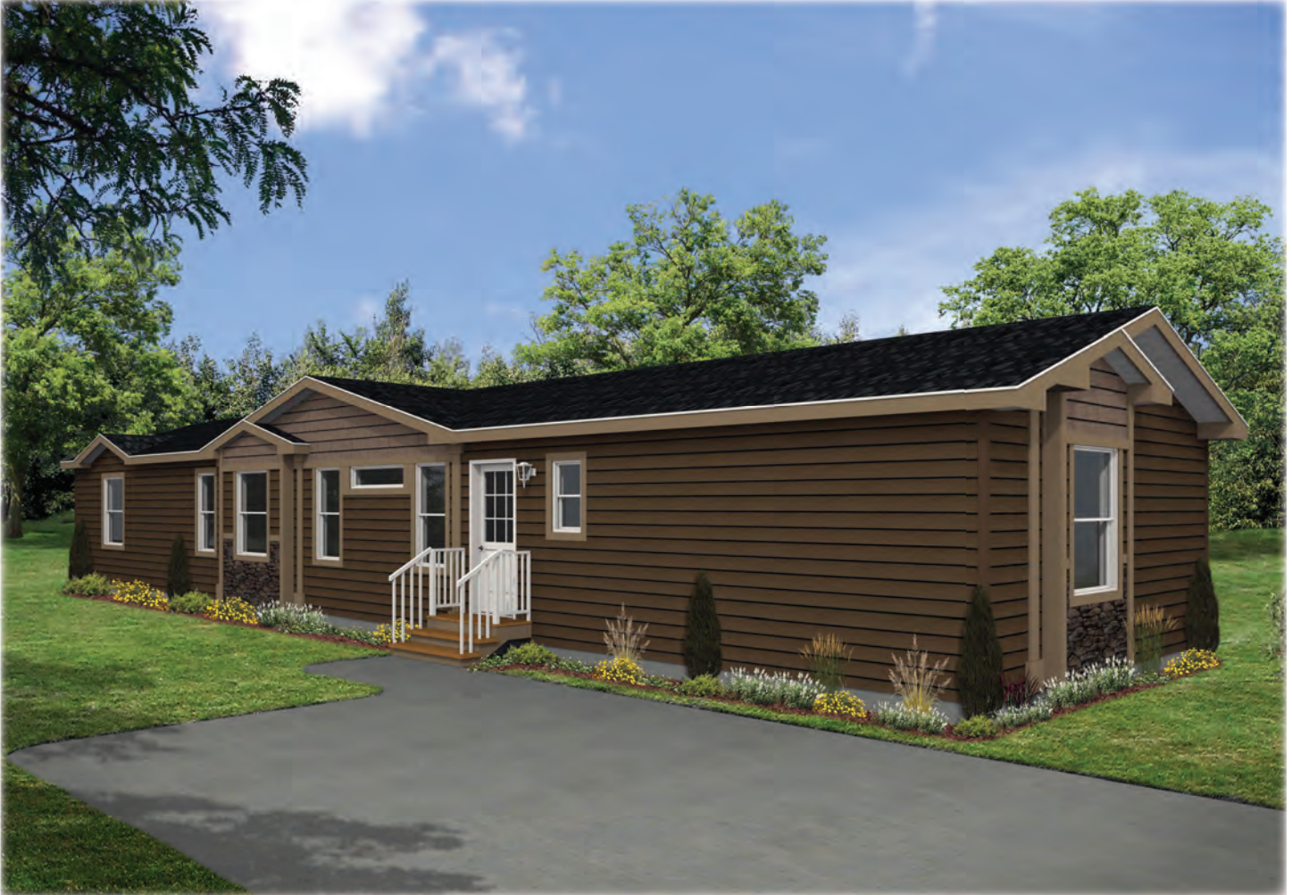
Options shown in image: 9-lite Front Door, Apex Exterior.